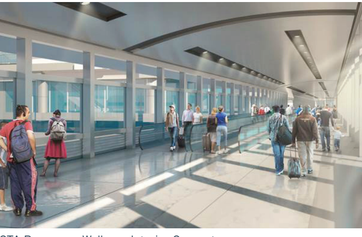
CTA Passenger Walkway Interior Concept