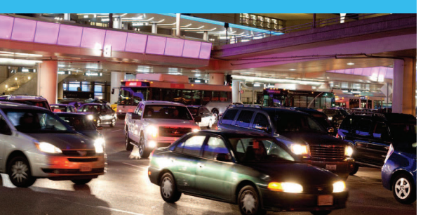
Relieve traffic congestion within the Central Terminal Area and the surrounding streets