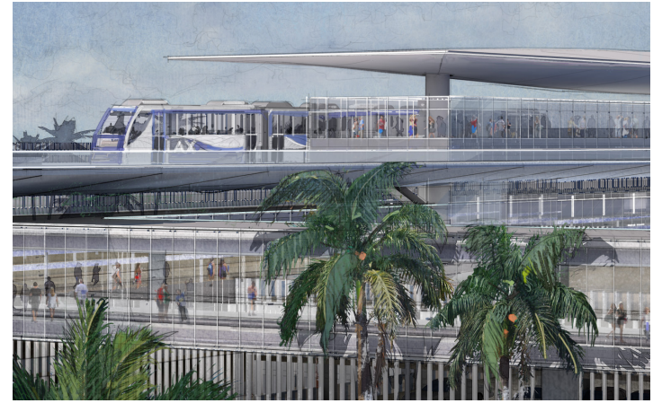
Automated People Mover (APM) Concept