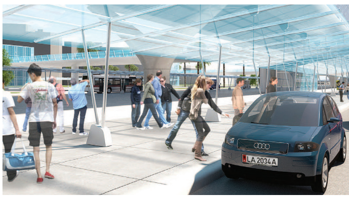
West ITF Curbside Concept