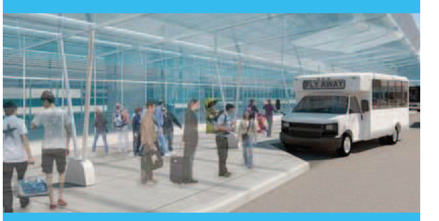
Give passengers a fast and reliable way to get to their flights