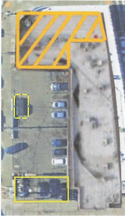
Exhibit D: Mural Wall